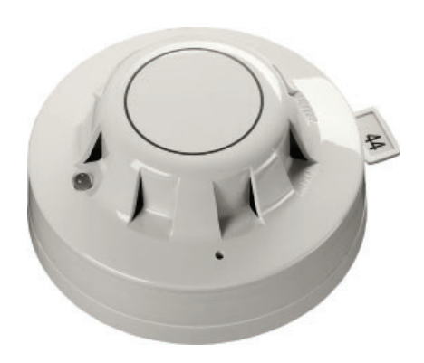
F900-650 Addressable Photoelectric Smoke Detector