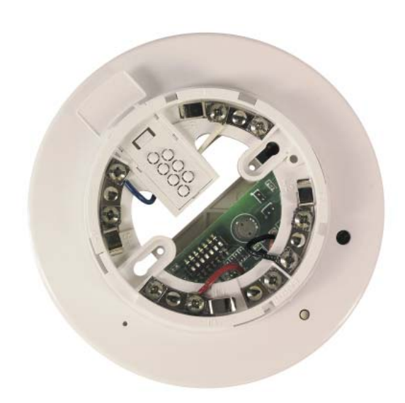
Analog Addressable CO Sounder Base F900-MB-6CO

The 6-inch diameter F900-MB-6CO Analog Addressable CO Sounder Base mounts to 4-inch octagonal and 4-inch square boxes. When mounting on a ceiling, install at least 4-inches from the wall. When mounting detector on the wall, install 4 to 12 inches from the ceiling.